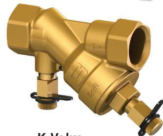
K Valve (Automatic Flow Limiting Valve)