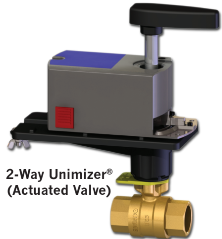
2-Way Unimizer® (Actuated Valve)