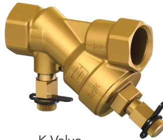
K Valve (Automatic Flow Limiting Valve)