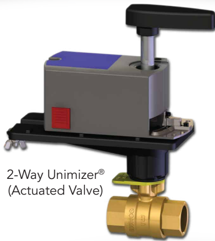
2-Way Unimizer ® (Actuated Valve)